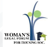
Women's Legal Forum Co-operative Housing Society